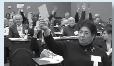
School board representatives cast votes during NJSBA's Delegate Assembly Nov. 17 in East Windsor. Next week's School Board Notes will feature a full report on the semi-annual meeting.