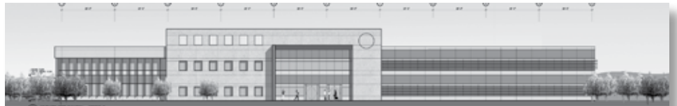
Architect's rendering of NJSBA's new headquarters and conference center in central New Jersey. NJSBA anticipates completion of the member-accessible, environment-friendly building in 2009. (SNS Architects & Engineers, P.C.)

Getting to Construction The Board of Directors' vote followed the recommendation of the NJSBA Construction Review Committee to approve the architect's rendering of a 51,174-square-foot two-story