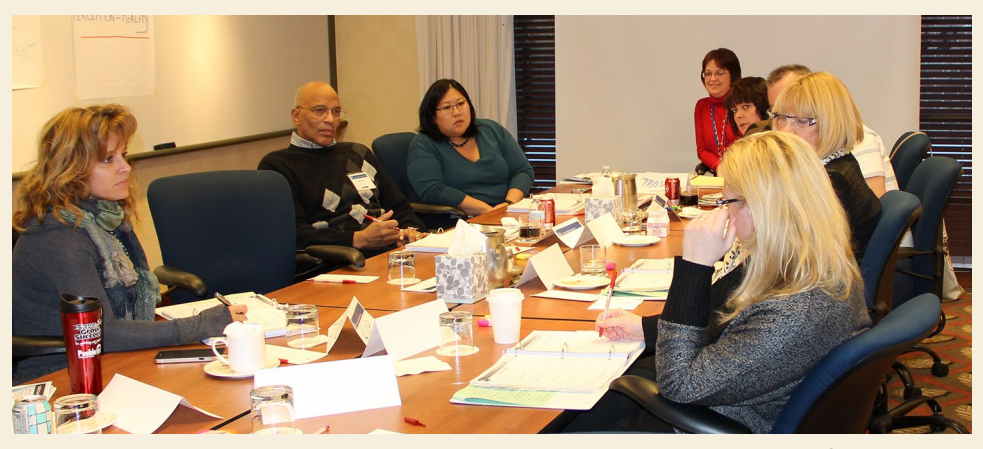
Orientation program attendees participate in training exercises at one of a number of small group sessions designed to provide a hands-on experience for new board members.

School board members must attend training programs in each of the three years of their first term, and in the first year of any new term if re-elected or reappointed.