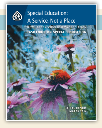
The entire text of the report may be accessed at www.njsba.org/ specialeducation2014.

The state should develop a multi-tiered system of supports, including programs such as Response to Intervention, Intervention and Referral Services, and Positive Behavioral Supports, to identify students with learning needs at an early stage and implement strategies. The process should include ongoing assessment and evaluation. Such early intervention in the general education classroom would improve student outcomes and enable schools to avoid overclassifying children