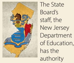
to carry out the mandates created by those higher bodies.