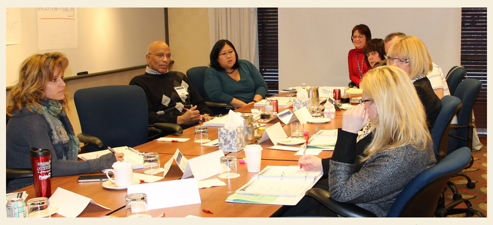
Orientation program attendees participate in training exercises at one of a number of small group sessions designed to provide a hands-on experience for new board members.

School board members must attend training programs in each of the three years of their first term, and in the first year of any new term if re-elected or reappointed.