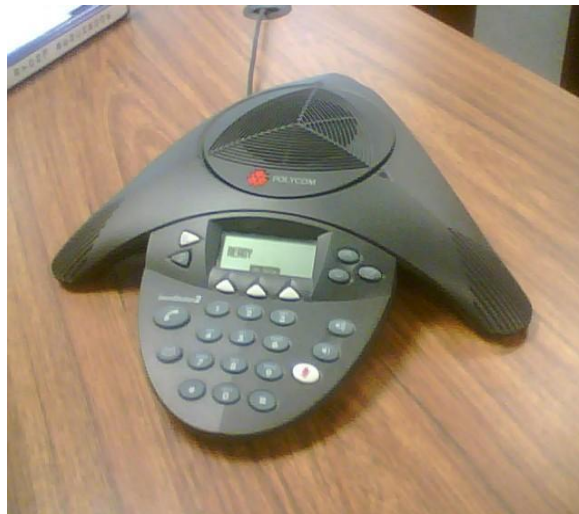
Potential Downside of Office Phone Conferencing